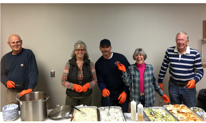
Serving breakfast to Burn Foundation children August 2023