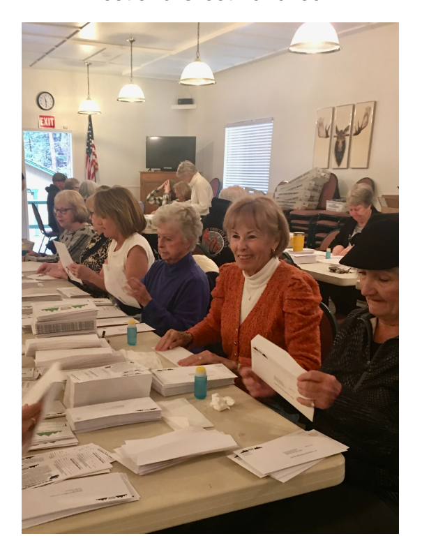
Busy Angels at Ebbetts mailer