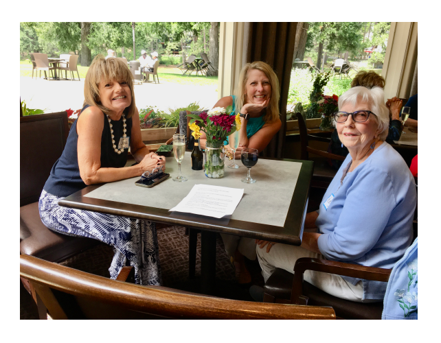
Meet and Greet Luncheon

On May 30 we held our second "Meet and Greet Luncheon" at Sequoia Woods Country Club.